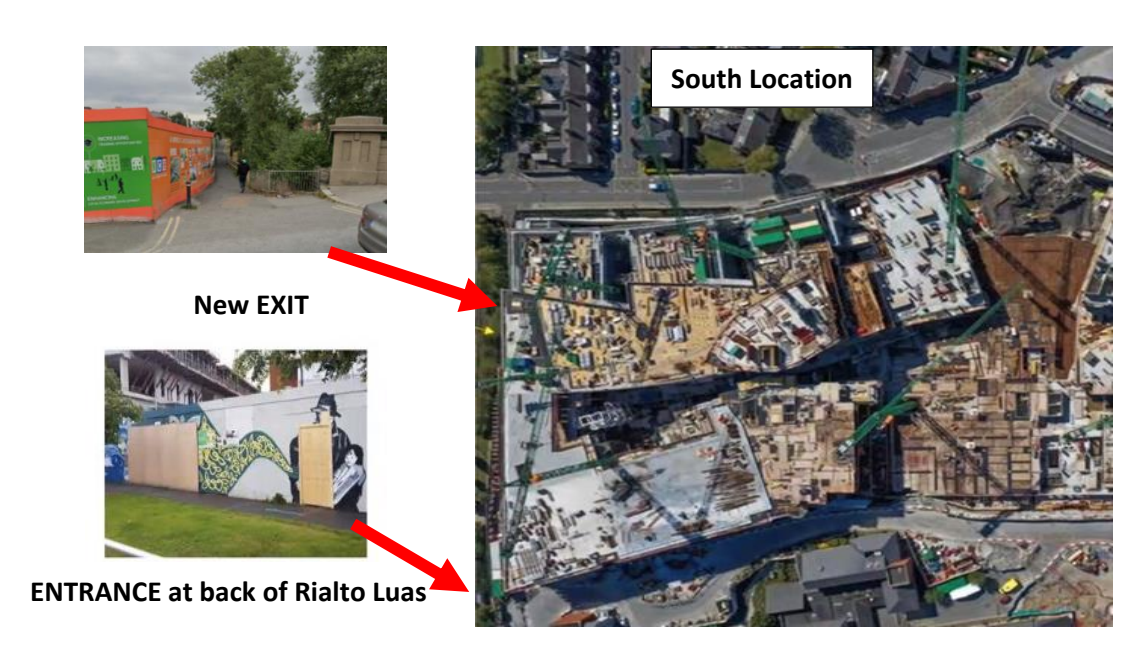
Figure 1 South Side Location at Rialto Bridge and Luas Stop

A turn stile operation is being installed at both locations and they will be a one way system. So on the south side the old entrance at the back of the Rialto stop will be the entrance and further up the Rialto bridge will be the exit. Each opening also has a door entrance for visitors/bikes etc.